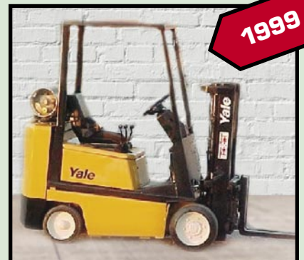
(1 OF 2) YALE 4,000 LB. CAP. FORKLIFT