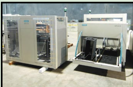
SIEMENS BOARD STACKERS

SIEMENS SIPLACE BOARD STACKING CONVEYOR SYSTEM ; (8) 20' SECTIONS OF CONVEYOR TECHNOLOGIES INC. MODEL XCW-20F POWERED PC BOARD CONVEYOR w/multiple assembly stands, adj. width, (7) operator stations per stand; (12) CONVEYOR TECHNOLOGIES MDL. XLTXTX CONVEYORS ; (12) PANASONIC MODEL BIP XL CONVEYORS ; (3) PANASONIC MODEL BSF V2 XL BOARD LOADERS ; (7) PANASONIC MODEL IBBS XL FIFO BUFFERS ; (2) CONVEYOR TECHNOLOGIES AUTOMATIC BOARD TRANSFER MACHINES ; (10) DYNAPACE COOLING FAN BANKS ; (3) DYNAPACE SHUTTLE CONVEYORS .