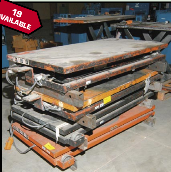
PARTIAL VIEW OF HYDRAULIC LIFT TABLES