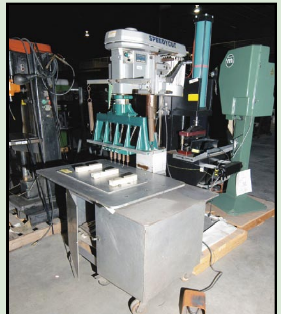
VIEW OF TAPPING MACHINE & TOX FASTENING MACHINE