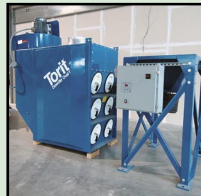
TORIT CARTRIDGE STYLE DUST COLLECTOR