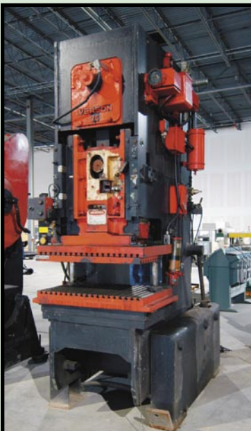
75 T. CAP. VERNON OBI PUNCH PRESS

MILFORD MDL. 255 RIVETING MACHINE , tooled for rivet 501/502, 10" throat depth, foot pedal control, appears unused S/N 3294.