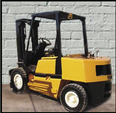
YALE 10,000 LB. CAP. FORKLIFT

ASSETS OF A MAJOR FABRICATOR Moved for the Convenience of the Sale 780 Shiloh Road PLANO, TEXAS 75074