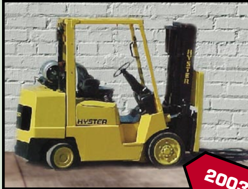
HYSTER 8,000 LB. CAP. FORKLIFT