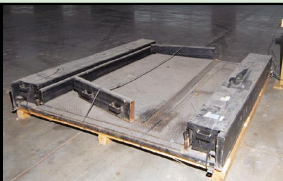
5,000 LB. DIGITAL PLATFORM SCALE

If you cannot attend this sale we will bid on your behalf. Contact Houston office at (713) 691-4401 for instructions, or go to our website at www.pmi-auction.com .