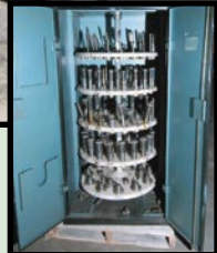
PARTIAL VIEW OF AMADA TURRET PRESS TOOLING