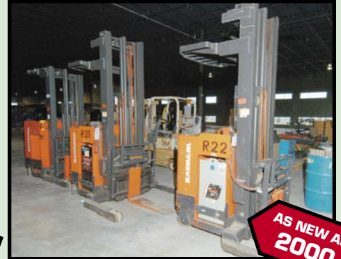
RAYMOND ELECTRIC REACH TRUCKS