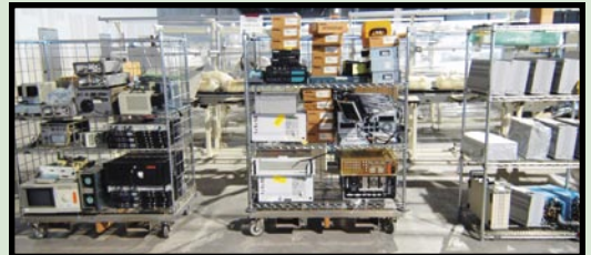
PARTIAL VIEW OF ELECTRONICS TEST EQUIPMENT