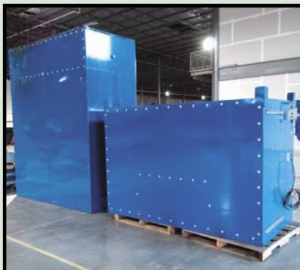
TORIT DOWNFLOW BAGHOUSE DUST COLLECTOR

(5) MILLER CHILLER UNITS; MILLER MDL. S52E WIRE FEEDER; MILLER MDL. 22A24V WIRE FEEDER; (19) M.K. PRODUCTS MDL. 158-001 - 120 V. PULSE WELDING CONTROL UNITS.