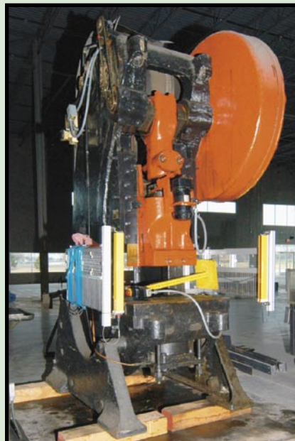
110 T. CAP. CLEVELAND OBI PUNCH PRESS