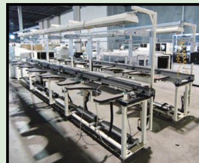
< PARTIAL VIEW OF BOARD CONVEYORS