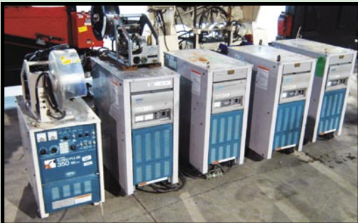
OTC WELDING MACHINES