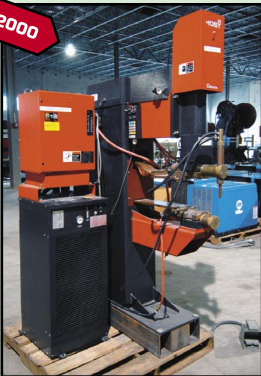
AMADA 80 KVA INVERTER SPOT WELDER w/COOLER