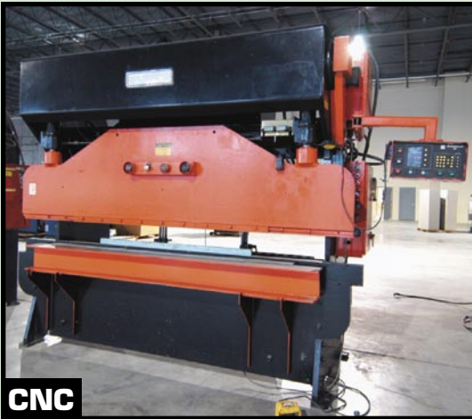
CNC DIACRO 75 T. CAP. HYDRO-MECHANICAL PRESS BRAKE