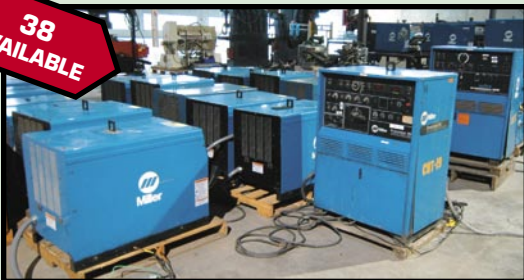
MILLER MIG & TIG WELDING MACHINES