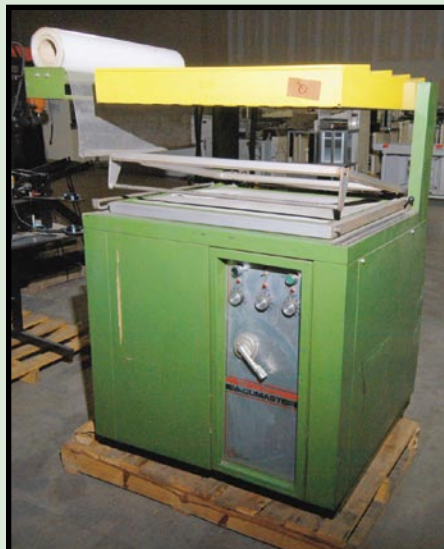
SERGEANT VACUMASTER VACUUM PACKAGING MACHINE