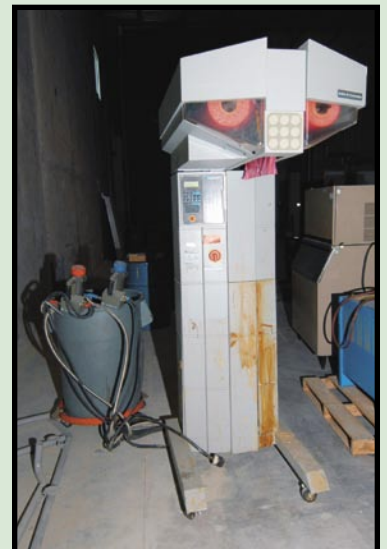
FOAM PACKAGING SYSTEM