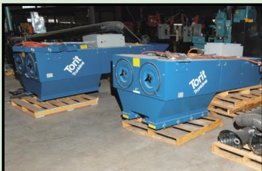
TORIT FUME COLLECTORS