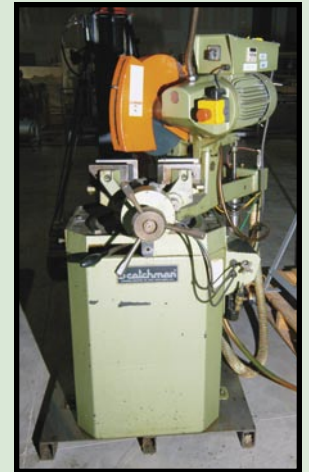
SCOTCHMAN COLD SAW