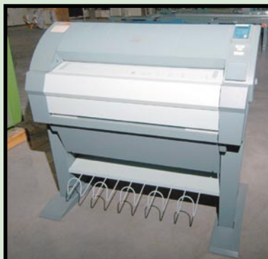
OCE BLUEPRINT COPIER/PRINTER