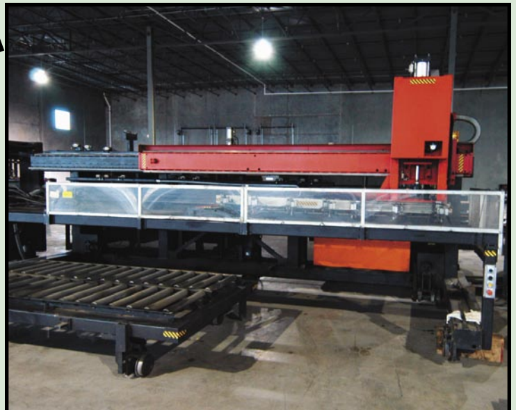
AMADA SHEET LOAD/UNLOAD SYSTEM