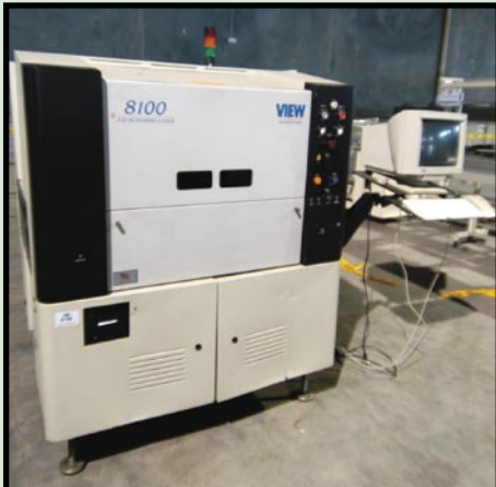
VIEW 8100 SCANNING LASER

INSPECTION Monday, March 5 9:00 A.M. to 4:00 P.M. & Morning of Sale