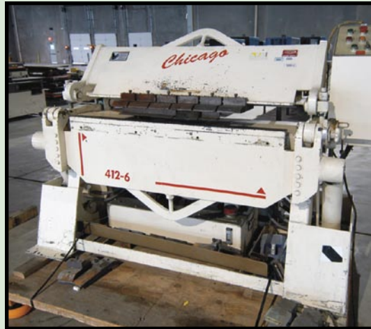
CHICAGO HYDRAULIC BOX & PAN BRAKE