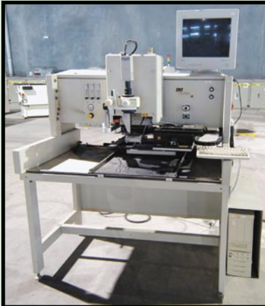
SRT VISUAL INSPECTION SYSTEM