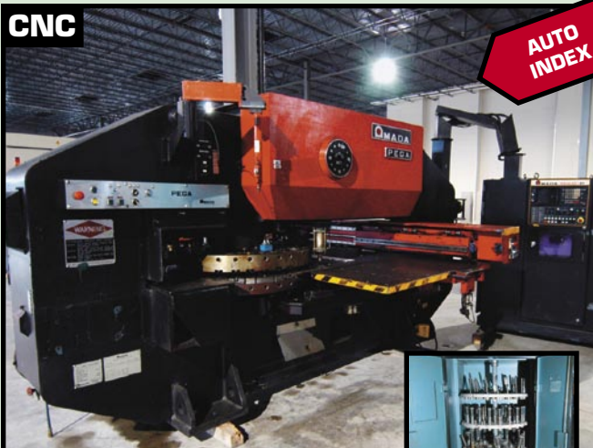
AMADA PEGA 345 CNC TURRET PRESS

MARSHALLTOWN , Mdl. 2, mechanical clutch, safety device.