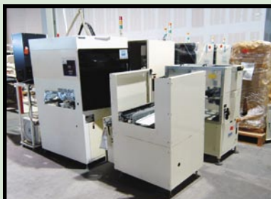
PC BOARD CONVEYORS & SOFT BEAM SOLDERING MACHINE